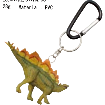
FD-405 Stegosaurus Real Figure Keyring

Size : L9×D3×H4.5cm Weight : 18g Material : PVC