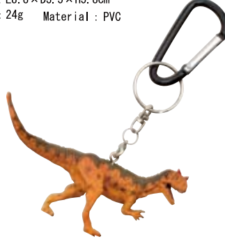
FD-404 Allosaurus Real Figure Keyring

Size : L9.5×D1.9×H7.7cm Weight : 22g Material : PVC