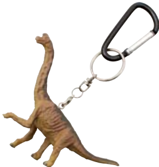
FD-403 Brachiosaurus Real Figure Keyring

Size : L8.4×D2.5×H4.5cm Weight : 28g Material : PVC