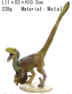
FD-756 Deinonychus Metal model

Size : L8.5×D4.5×H5cm Weight : 116g Material : Metal