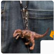
Figure & Keyring 2WAY

This is one of Dinosaur Key Ring. You can hook key and hang it on the bag. And also can display it with base on the desk and any other place you like.