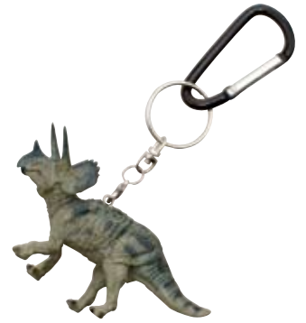
FD-402 Triceratops Real Figure Keyring

Size : L8.8×D3.5×H5.8cm Weight : 24g Material : PVC