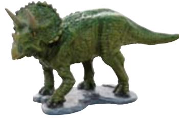
FD-752 Triceratops Metal model

Size : L10.5×D5×H7cm Weight : 268g Material : Metal