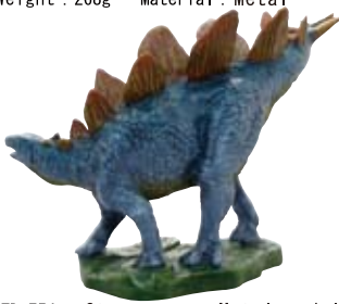
FD-754 Stegosaurus Metal model

Size : L11×D3×H10.3cm Weight : 228g Material : Metal