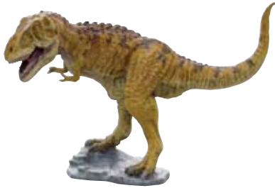
FD-751 Tyrannosaurus Metal model

This is made by Metal. Size is small but weight is very heavy, so you can feel great value. And painting is very detailed.