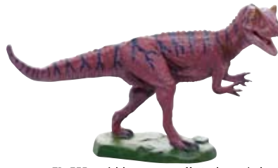
FD-755 Allosaurus Metal model

Size : L7.5×D4.3×H4.7cm Weight : 158g Material : Metal