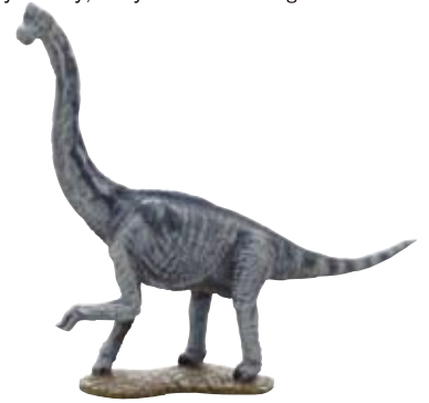
FD-753 Brachiosaurus Metal model

Size : L8.5×D3.3×H4.8cm Weight : 220g Material : Metal