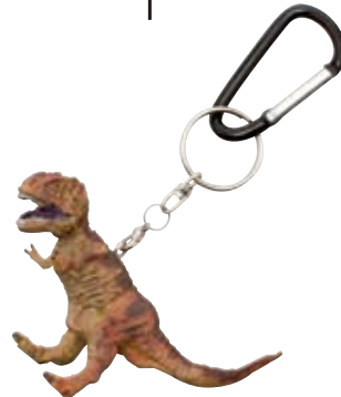
FD-401 Tyrannosaurus Real Figure Keyring

Size : L8.8×D3.5×H5.8cm Weight : 24g Material : PVC